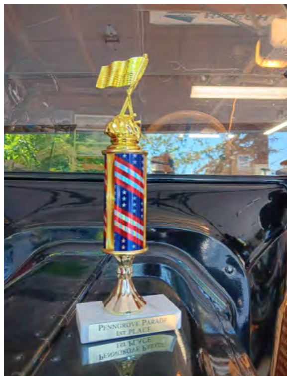
Pat O'Halloran's First Place Trophy